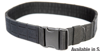
Available in S, M, L, & XL

Spend at least $20.00 on any BLACKHAWK holster and get 25 percent of the purchase price back. OR spend at least $35.00 and get a BLACKHAWK Foundation Series MOLLE Gun Belt (retail value $50.00). Rebate calculated on purchase price only, does not include taxes and/or shipping/handling fees.